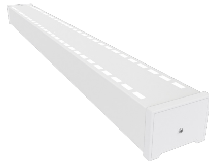
Uplight option shown