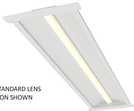
RS-FR STANDARD LENS OPTION SHOWN