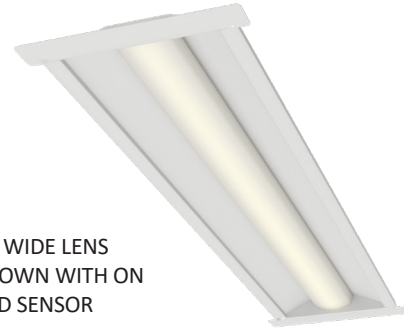
RS-T25 WIDE LENS OPTION SHOWN WITH ON BOARD SENSOR