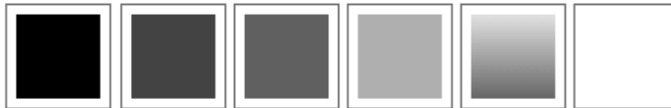
BLACK DARK BRONZE GREY HOT DIPPED GALVANIZED ALUMINUM PAINT WHITE